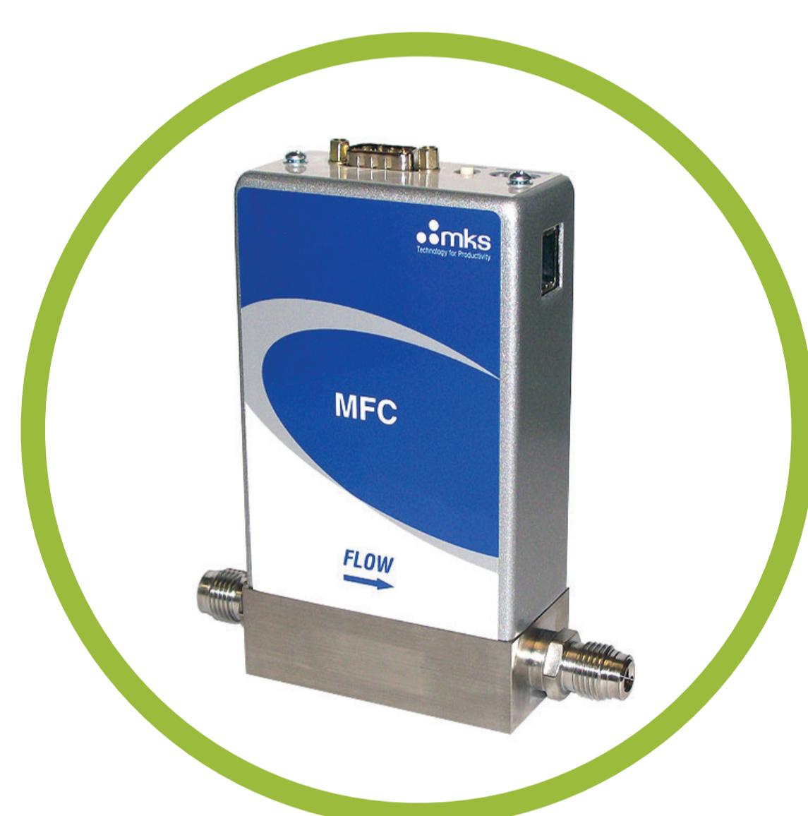
MASS FLOW CONTROLLERS, PRESSURE CONTROLLERS, VERIFIERS & CALIBRATION UNITS