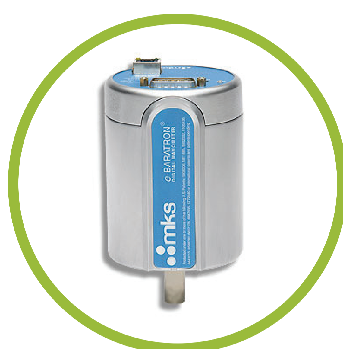
VACUUM MEASUREMENT, CONTROLLERS & VACUUM VALVES