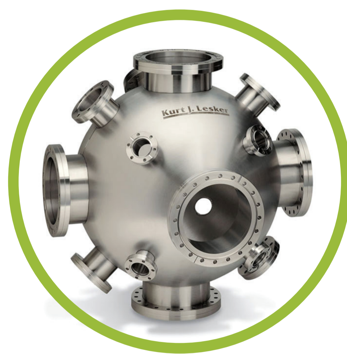
UHV VACUUM CHAMBER MANUFACTURE & DESIGN