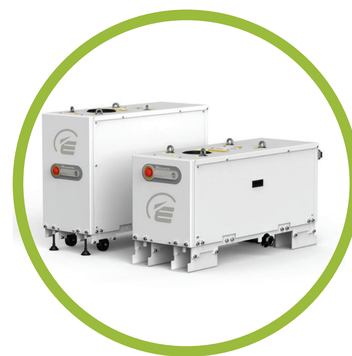
INDUSTRIAL/ CHEMICAL DRY PUMPS & BOOSTERS