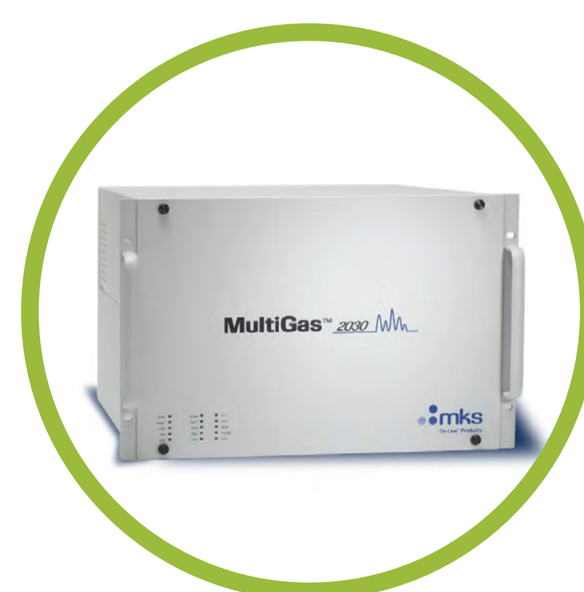
FTIR/NDIR INFRARED GAS ANALYSIS INSTRUMENTS & RESIDUAL GAS ANALYSERS