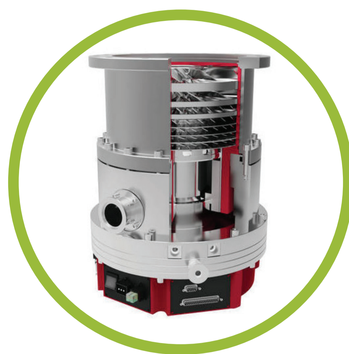
TURBOMOLECULAR MAGLEV & HYBRID PUMPS