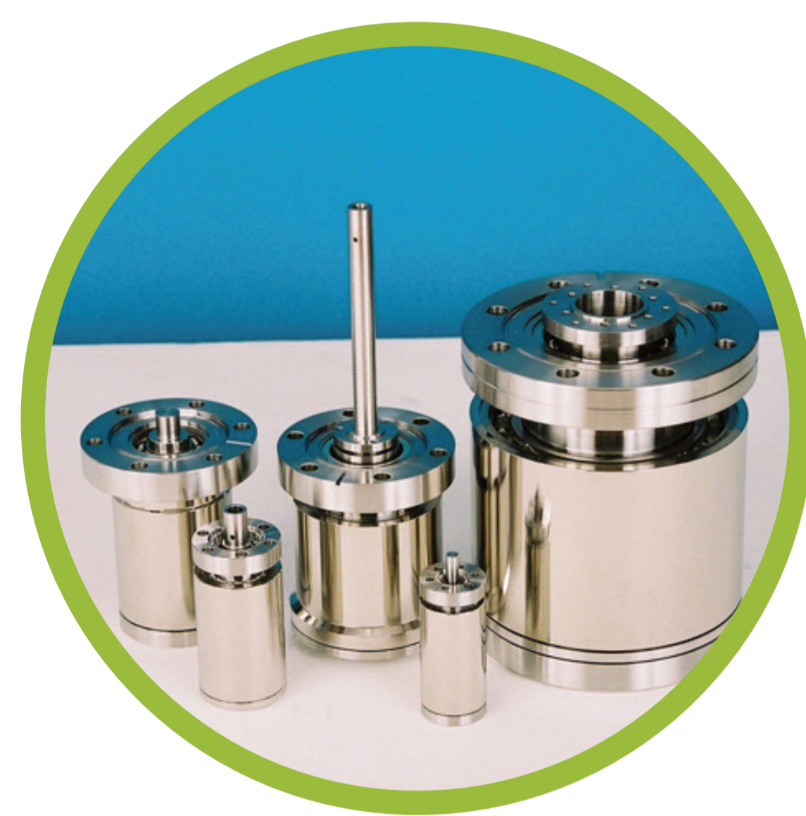
UHV MOTION & MANIPULATION, DEPOSITION STAGES & HEATING