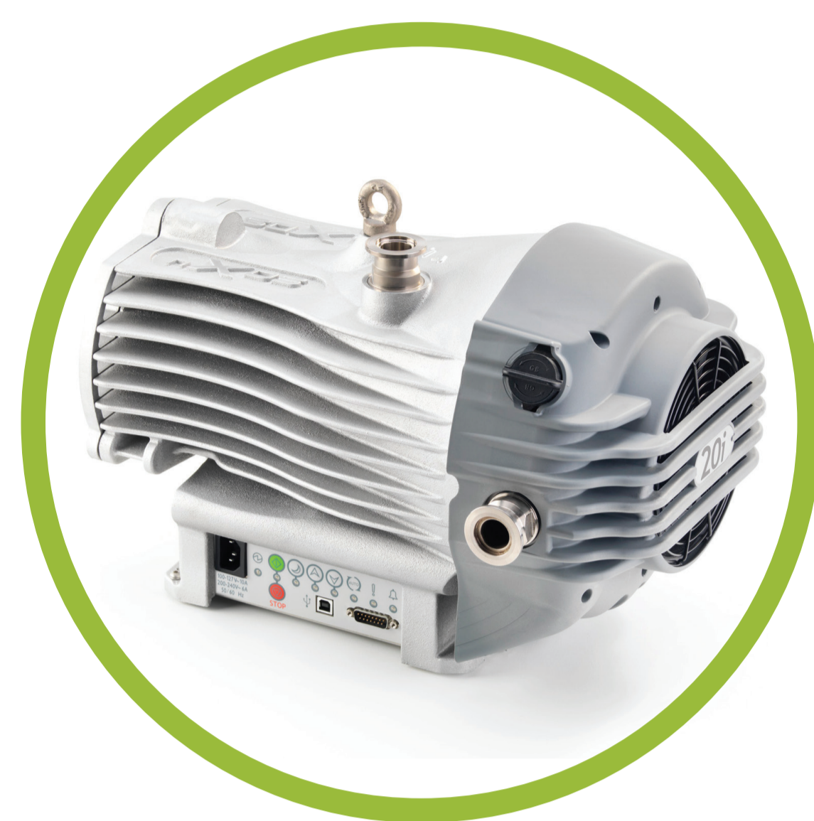
SMALL DRY/ OIL SEALED VACUUM PUMPS